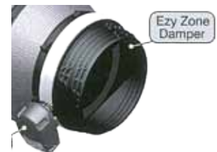
adMDEY..24 attached to reducer