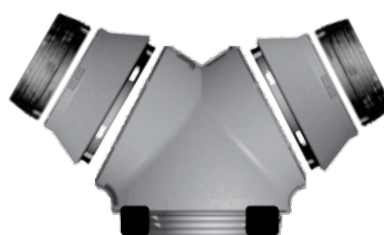
adEZYi insulated Y-body + 2x adERi insulated Y-reducers + 2x adEZC Y-collars