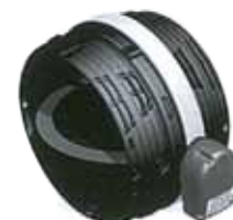
Motorised and manual in-line dampers also available

Due to a policy of continuous development, prices and specifications are subject to change without notice.