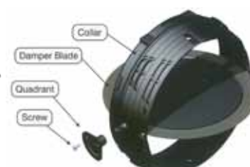
adEZY + adEB + adEDQ