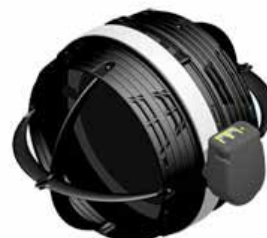
adMDE Motorised dampers on p78a