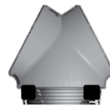
adEZYi insulated Y-body