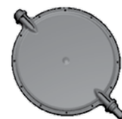
adEB Y damper blade