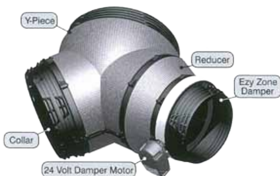
Assembled insulated EZY branch different sized collars and with motorised damper