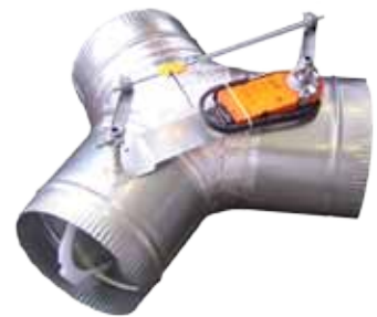
Motorised Damper Diverting Branch