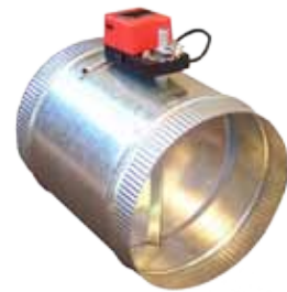
Motorised In Line Dampers (230V AC) MILD SE/SE