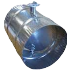
Manual In Line Dampers