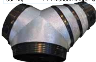
Insulated Y branch 350/300/200 with damper on 250 note: 2 reducers can be used