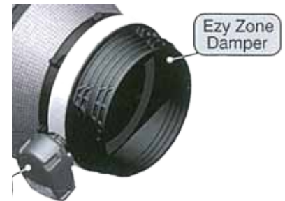
adMDP..E (without back collar) attached to reducer

Due to a policy of continuous development, prices and specifications are subject to change without notice.