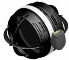
adMDP 24V Motorised Damper