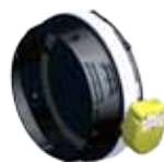
see p58 for clip on motorised dampers 24V & 240V