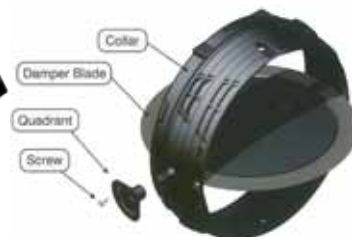
adEZC + adEB + adEDQ

See over page for examples & motorised dampers