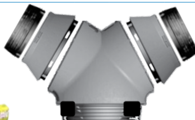
adEZYi insulated Y-body + 2x adERi insulated Y-reducers + 2x adEZC Y-collars