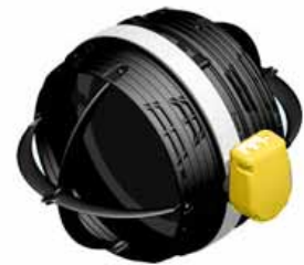
adMDE 240V Motorised Damper