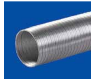
Rigi-Flex Aluminium Duct