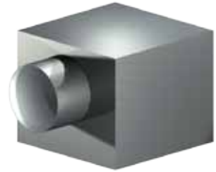
Side Entry Grille Box