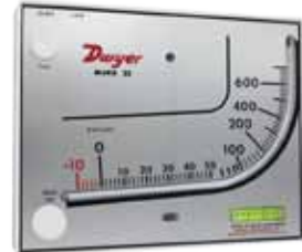
Dwyer Mark2 M-700Pa Manometer