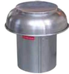
Mini Monica Roof Extract / Supply Unit